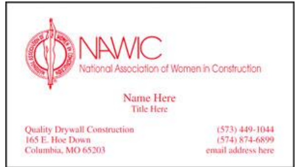
Front – Option 1